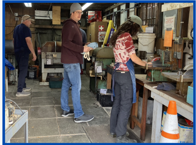
The saw room hummed on January 25, while up above, footsteps clomped.