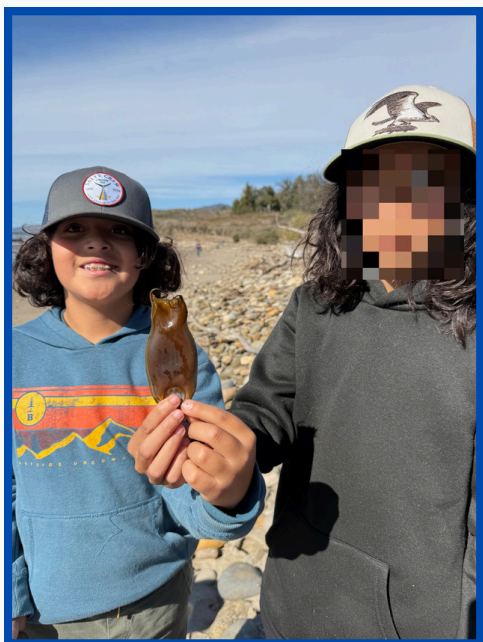
A mermaid's purse

This field trip's success hinges on a good storm and Mother Nature didn't disappoint. Last week we had the first measurable rainfall of the season. Slow and steady, the rain came and went in a matter of a few days. The clouds parted, and skies cleared, just in time for the most glorious sunshine filled day of possibilities to search for fossilized whale bone, beach agate and more.