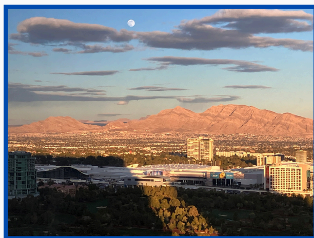
Frenchman Mountain stands out clearly on the horizon to the north of Las Vegas.

Frenchman Mountain—and the Grand Canyon—offers a clear view of a unique geological wonder. At both places, you can clearly see The Great Unconformity. An unconformity is a break in time in an otherwise continuous rock record. It reveals a gap in that record corresponding to a period or periods of non-deposition or to weathering and erosion that erased pages from the history book of Earth. You see many spots in and around Ventura where slanted or folded sediment has been sheared off and is capped by horizontal sediments. In our region, these often represent a gap of hundreds of thousands of years or perhaps a few million at most. That’s nothing!