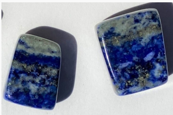
We challenged kids this month with lapis lazuli.