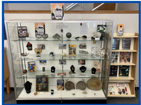
Head to E.P. Foster Library and check out our club display!

The exhibit both promotes our March show and educates the community about our society and the many facets of our hobby. Thus, we showed off a wide range of specimens: fossils, rocks and minerals, lapidary and jewelry work, and beading. We augmented the specimens with photos showing activities within the club and within the community at large. Also, because this is in a library, we included a small array of books about minerals, fossils, and lapidary arts, and Robert arranged for a selection of books from the library itself to be on display in a bookshelf alongside our exhibit.