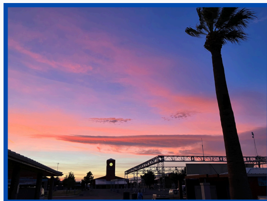
For Mother's Day, take Mom to Lancaster to participate in the CFMS Convention!