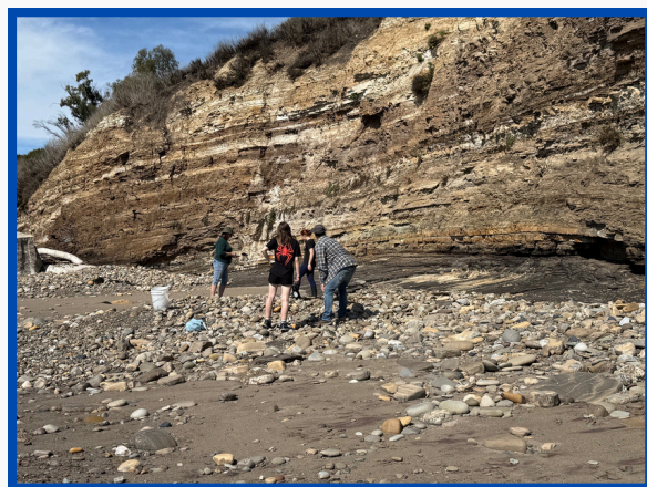
Enjoying a field trip to Tajiguas Beach

Located approximately 55 miles north of Ventura, Tajiguas is past Refugio State Beach. When you first arrive you may not know the beautiful beach beyond the railroad tracks and down the cliff is a wide swath of pristine shoreline where a creek runs into the ocean. During the winter months storms churn up the cobbles and expose fossils waiting to be discovered. This location is usually not populated by many visitors due to the obscure entry to the beach. But that also comes with no bathrooms and no lifeguard so you need to be aware of your surroundings and the tide.