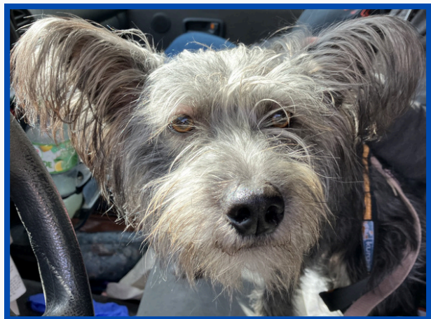
Pebble puppy Sadie worked on polishing bones at our January 25 workshop.

With the New Year firmly established and advancing, don't get left behind! If not yet certified to use the club's machinery, sign up for a certification session. If already certified, take full advantage of our workshop studios and start having fun!