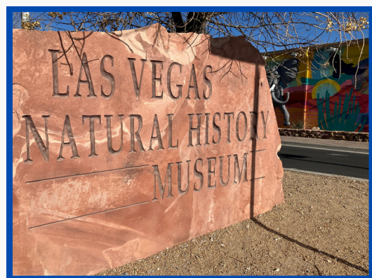
If ever in town, check out the Las Vegas Natural History Museum.