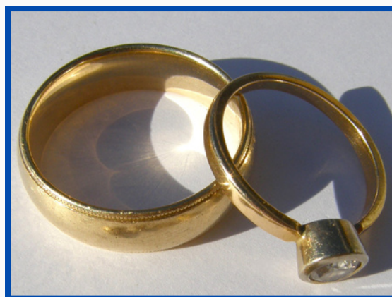
Wedding rings go back—way, way back some 5,000 years!

Wedding and engagement rings date back 5,000 years to the ancient Egyptians but were greatly popularized within the past 100 years courtesy of the De Beers diamond company (no surprise there). Interesting statistic: in the U.S. alone, 17 tons of gold gets crafted into wedding rings EACH YEAR! Why gold? It's considered the purest of metals. For those ancient Egyptians, it was enough to use rings crafted from leather or braided hemp. Proves kinder to the budget of a fledgling family. Placing the ring on the fourth finger of the left hand dates to ancient Romans, who believed a vein ran directly from there to the heart. So if you, too, wear a wedding ring, give it a little twirl each February 3rd and get back in touch with the person who makes your heart skip.