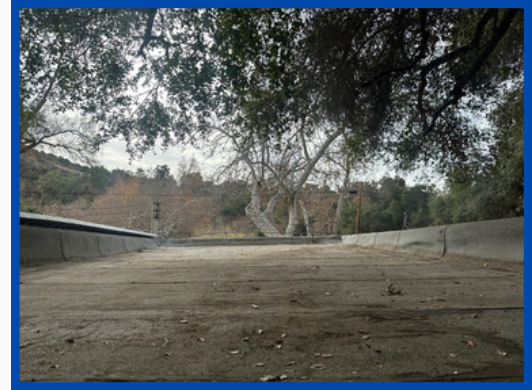
Can you guess this view?*

I write this missive a day after a Super Bowl win by the Philadelphia Eagles – Fly Eagles Fly! Over the past few weeks, we have seen the LA fires finally put out, we got a bit of rain to restore some moisture in the environment, and the weather has given us several successive, beautiful days! Well, with January flying past us here we are with our show coming up the first of March this year. It is time to clean out your drawers, garage or rock pile(s), and bring some of those goodies in. We need your donations for the Silent auction, Raffle, Plant Sales, and of course the Country Store. You can contribute by bringing donation items to the membership meeting or better yet come to Camp Comfort and meet the crew out there and drop your goodies directly at the club house; you can also bring them directly to the fairground on days when we are setting up for the big show. Also, don't forget to sign up to exhibit your collections. Many who come to our show say the driving reason they come is to see all our members' great collections!