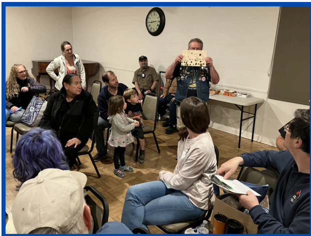
Our program for January was a member show-and-tell that included a pebble pup's rock collection.

The club meeting on January 22nd was our annual "Show and Tell". Club members who wanted to share their rock hounding experiences were asked to get up and tell us of their adventures in 2024. Many of the club members shared their experiences in the field collecting, going to Quartzsite or spending time doing lapidary arts. It sounded like many club members went to a lot of exotic places to rock hound in 2024! I would like to thank all others who also shared with us their rock hound adventures.