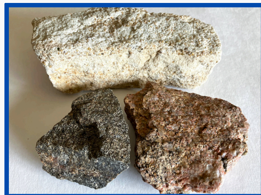
The Cambrian Tapeats Sandstone is a mere 520 million years old, while the Precambrian granite and schist immediately beneath it ring in at 1.7 billion!

If you, too, ever find yourself in Las Vegas, this is an easy field trip that takes no more than an hour or so. And while in town, drop by their nice little Las Vegas Natural History Museum. You won't see splashy high-end specimens like those in the Los Angeles gem collection, but you'll get a good geological and paleontological education. The museum seems geared to kids and classroom visits, and its exhibits are nicely done for that purpose. One room holds displays and small-screen video presentations on volcanoes, uses of minerals, Nevada minerals, fluorescent minerals, and more. An Ice Age Mammals gallery includes a Smilodon skeleton in attack mode, and a darkened Prehistoric Life Gallery holds animatronic dinosaurs and an exhibit on the Nevada state fossil: the giant marine ichthyosaur Shonisaurus . The museum also boasts "the best Rhynchotherium specimen in the world." And who doesn't love a good Rhynchotherium ? Next time in Vegas, check it out!