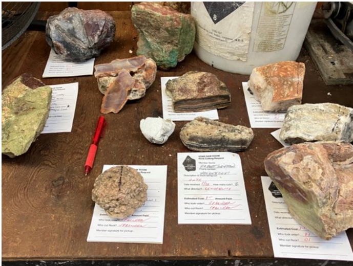
There was a tableful of material waiting to be slabbed on May 18 th .