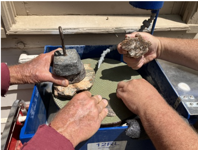
Tag-team flat-lapping on May 18 th .