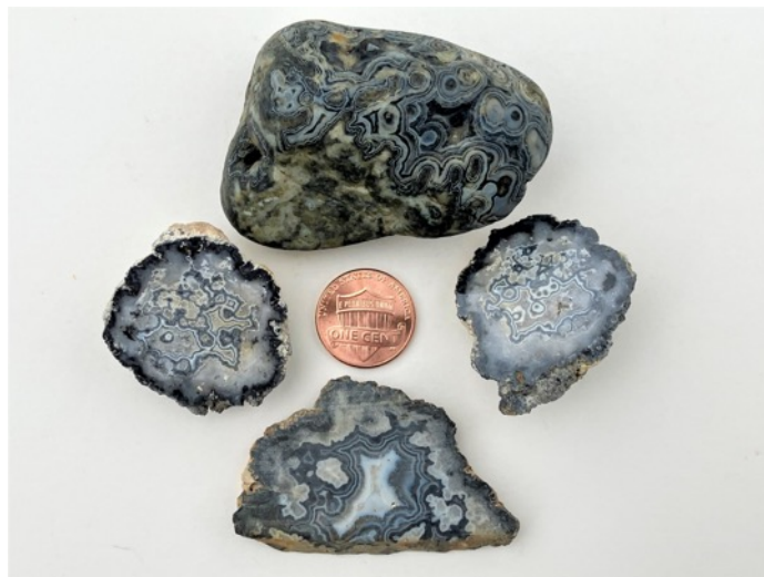
Attend the AFMS Show in Billings and you may come home with Bear Canyon agates!

https://cfmsinc.org/camp-paradise/ . The website includes a detailed document describing the whole experience. Check it out!