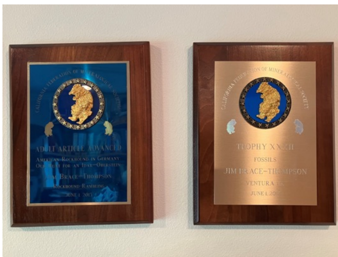
Who will earn coveted trophies at this year's CFMS Show & Convention?

After Lodi? Buckle your seat belts! Our very own VGMS will serve as host for the 2024 combined American and California Federation of Mineralogical Societies Show & Convention!