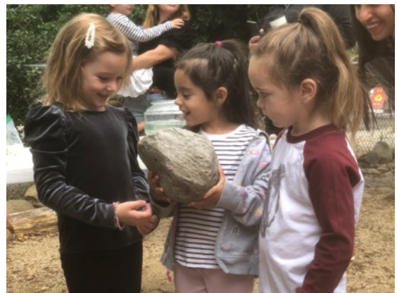
Kids exhibit superhuman strength lifting boulders of pumice!