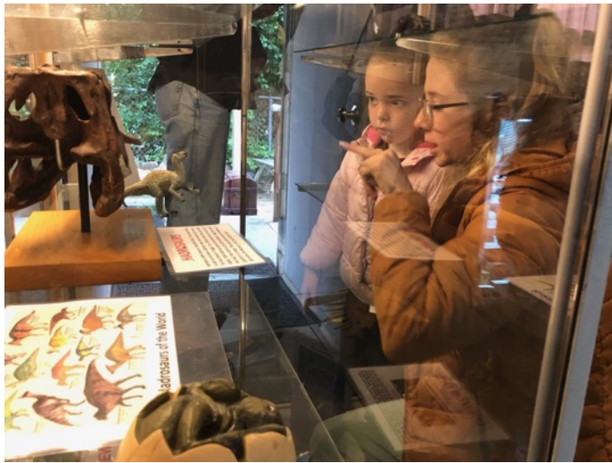
Checking out the bill of a duckbilled dino.