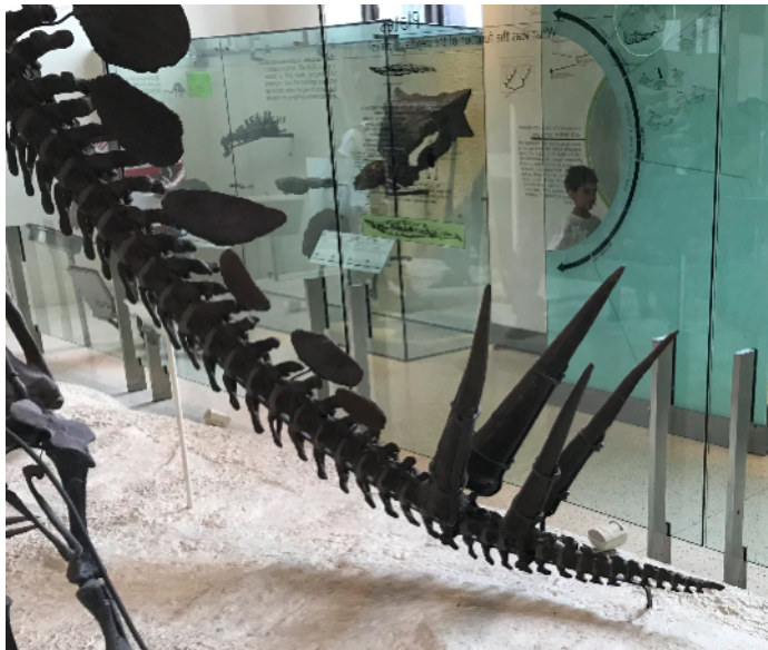
The group of spikes at the end of the tail is the thagomizer.

Gary Larson famously objects to having his cartoons reprinted digitally, but you can still see a Fair Use version of his original panel on Wikipedia .