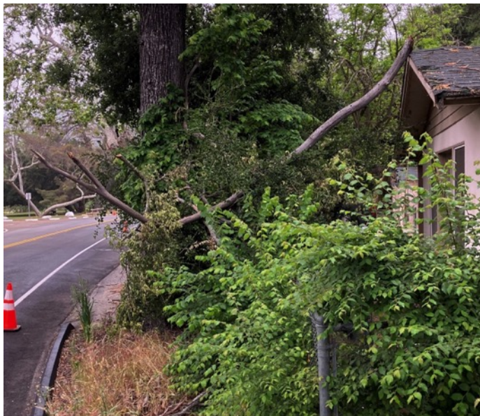
Oh no! It's raining tree limbs up at the clubhouse! Oh my!

As if becoming a magnet for homeless men seeking a spot to sleep it off wasn't enough last month, our clubhouse was recently threatened from above! Upon arriving for a classroom visit to the museum rooms, we spotted a rather large tree limb that, fortunately, fell a bit short of crashing through the front museum room window. The intruder was rapidly dispatched by Team Ron & John.