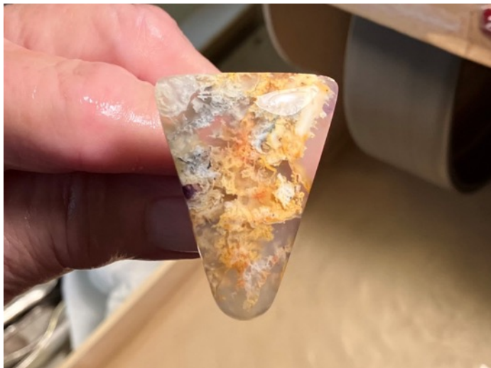
Fine-tune your cabbing skills at Camp Paradise.

As I've noted in previous months, the California Federation of Mineralogical Societies is accepting applications to attend "Camp Paradise," where you can sign up for one or two weeks of classes in lapidary and metal-working arts. Sessions take place August 20-26 and August 27-September 2. To register, go to