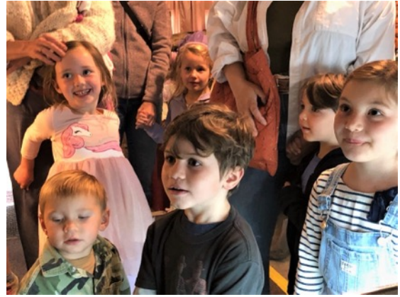
This is what makes educational outreach efforts all worthwhile.

keep the kids' attention. It seemed like the Blue Room kids had a great time, which they continued as they crossed over to the playgrounds and picnic tables at Camp Comfort.