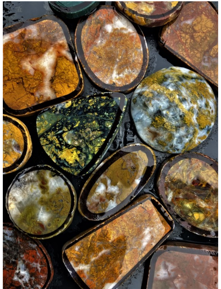
More fun with Ventura beach jasper on the June 4 th Workshop Day.