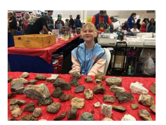
The kids had fun sharing their hobby with the public.

I had a lot of fun getting to arrange the Pebble Pup case! I started off by cleaning off the base boards with the help of my mom, we had to get all of the sticky tack off. Then we got all of the pictures that were going to need and I arranged them where I felt they looked best. After that my mom and I put up the walls and got all of the specimens out along with some stands to display them. I put the biggest specimen, the trilobite, in the middle as the center piece. Then I placed the two next biggest specimens next to it. The specimens that were found on field trips I put near the field trip picture, and the specimens from the weekly challenge next to the picture of the weekly challenge. I also put all of the crystals and shiny specimens on one side with all of the fossils in the front center. Then my mom took pictures of it so we could easily set it up. Then when it was finally time to put the case together I waited for another junior member, Lucia, to show up so we could set