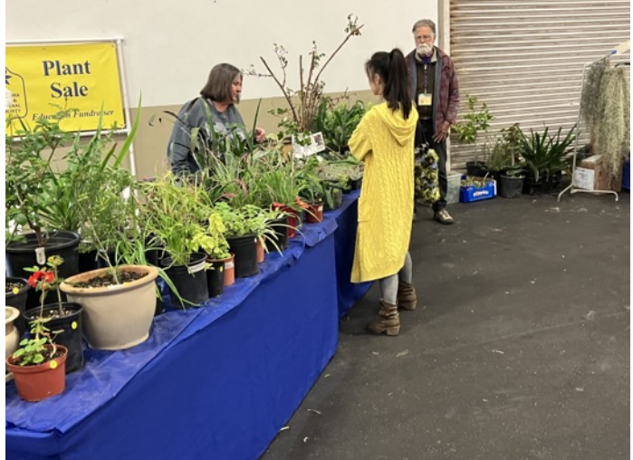
The Plants Booth is a relaxing and beautiful spot to spend time (and money!) during the show.

We were sort of low on items for sale due to storage capacity, but as usual when we put the word out to the members they came through with lots of great donations. They amaze me every year! Thank you to all who contributed.