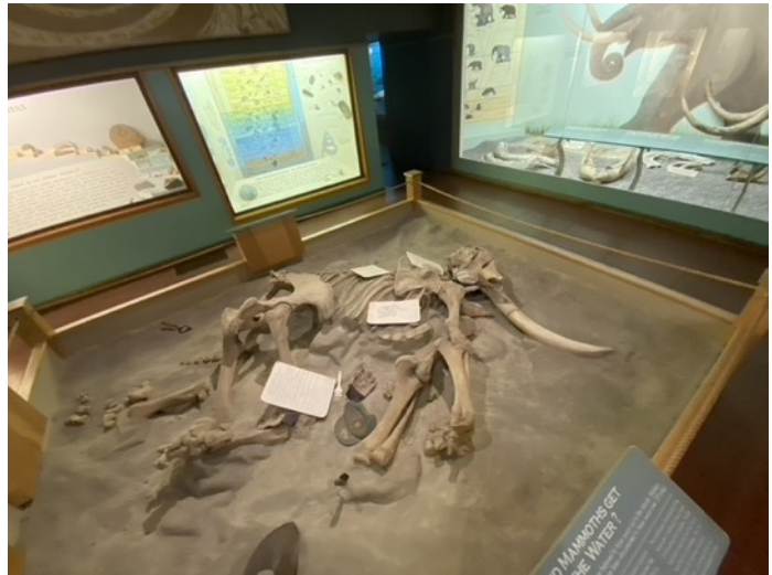
A replica of an almost-complete Pygmy Mammoth skeleton at the Channel Islands Visitor Center.

as 1856 on Santa Rosa Island, but at the time they were thought to be elephant fossils. Excavations of the 1920s led paleontologists to classify the remains as a new species, the Pygmy Mammoth. Pygmy Mammoth fossils have been found on all four of the northern islands, but the majority have been collected from Santa Rosa Island. In 1994, an almost-complete skeleton was found on Santa Rosa Island. It was a 50-year-old male Pygmy Mammoth fossil who lived about 13,000 years ago. You can see replicas of the 1994 fossil at the Santa Barbara Museum of Natural History and the Channel Islands National Park Visitor Center.