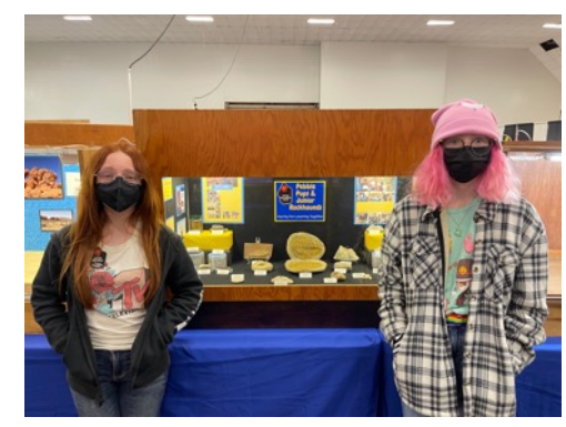
Putting together our Youth Society case helped me earn my FRA Leadership Badge.

it up as a team. Soon all the specimens were in place and it was done.