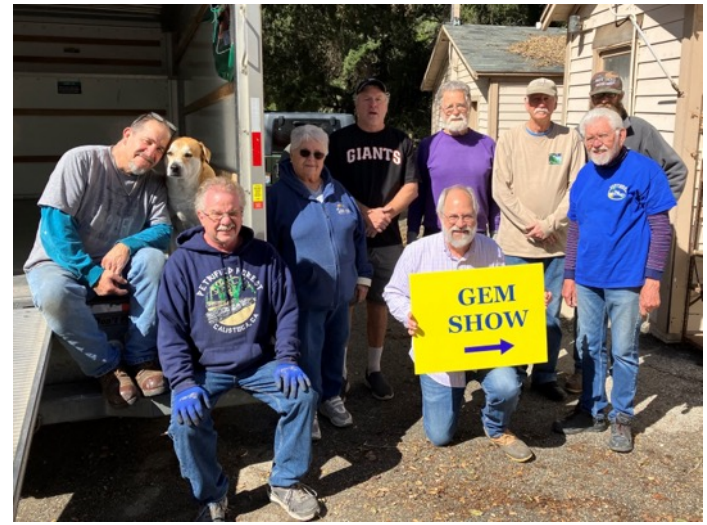
It ain't over till it's over! A big crew unloaded the show U-Haul at the clubhouse on March 6^{th} .