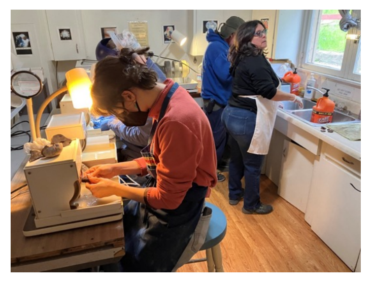
Our Genie rooms were crowded on February 18<sup>th</sup> with inspired lapidary artists.