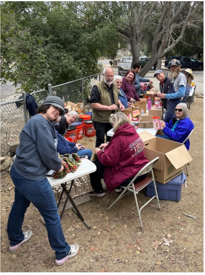
A great assembly line stuffed 665 grab bags on February 18<sup>th</sup>