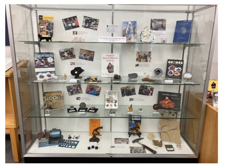
Displays like this at E.P. Foster Library helped publicize our show.

As you can see, there's a lot more to publicizing a show than meets the eye. By the way, publicity has already begun toward our 2024 Show! Watch for our "rough-and-ready" informal show flyers at the Conejo club show next month in Newbury Park. See you there?