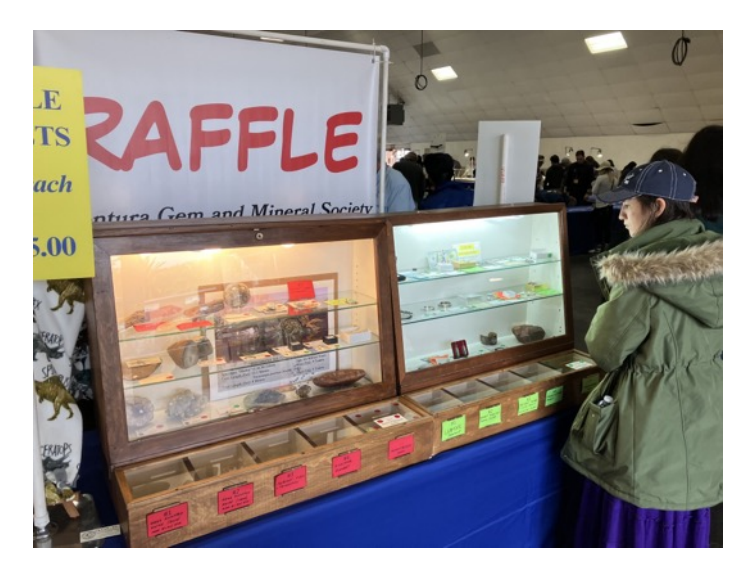
We had a lot of appealing items to win this year in our raffle.

Thanks to all those who donated items to the raffle. Without compelling items to draw interest, a raffle can flame out. In keeping with trends, since we always seem to break records nearly every year, I want to ask those members who have the talent to plan on contributing something for next year's raffle. The parameters to consider for submitting an item for the raffle are: something that will show well in a lit display case (jewelry and mineral specimens tick this box quite nicely!); something small enough to mail out if the winning ticket is not present; and something with a value of at least $25. Thanks all for your assistance and for your consideration for assisting next year as well.