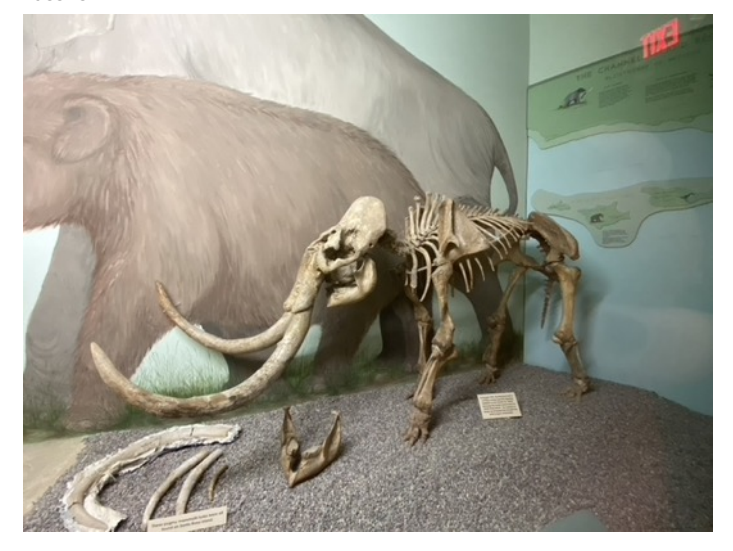
This display shows how small the Pygmy Mammoth was compared to mainland species.

there were no mainland predators to drive selection for larger body size, so the small mammoths flourished on the islands compared to the larger mammoths. Pygmy Mammoths became extinct around 10,000 years ago along with most of the other mammoth species. The exact reason is unknown, but scientists believe it could have been due to climate or environmental changes, human over-hunting, or a combination of the three. Of the hundred Native American fire pit sites excavated on the Channel Islands, over one third contained mammoth bone fossils.