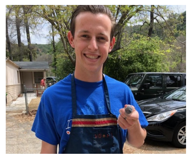
Congratulations to our 2023 Scholarship Winner!