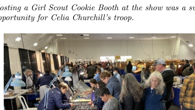
Ventura Gem & Mineral Society

Did we mention it was crowded? And this was on Sunday!