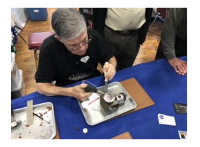
Learn new skills like silver casting at Camp Paradise.

in the menu on the right side of the screen, then click on "registration". The website also includes more info about the camp itself, including a detailed document describing the whole experience. Check it out!