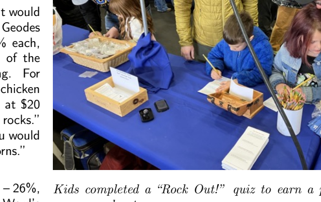
Kids completed a "Rock Out!" quiz to earn a prize in our scavenger hunt.